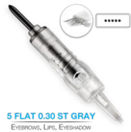
5 FLAT 0.30 ST GRAY EYEBROWS, LIPS, EYESHADOW