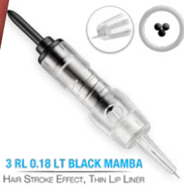
3 RL 0.18 LT BLACK MAMBA HAIR STROKE EFFECT, THIN LIP LINER