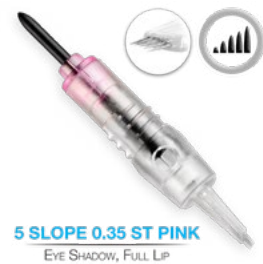
5 SLOPE 0.35 ST PINK EYE SHADOW, FULL LIP