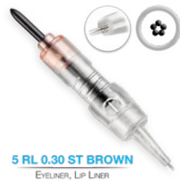
5 RL 0.30 ST BROWN EYELINER, LIP LINER