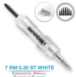
7 RM 0.30 ST WHITE EYESHADOW, AREOLA, EYEBROWS SHADOW