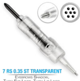
7 RS 0.35 ST TRANSPARENT EYEBROWS SHADOW, THICK EYE LINER, THICK LIP LINER