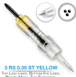
3 RS 0.35 ST YELLOW TOP LASH LINER, BOTTOM EYE LINER, BEAUTY MARK, THIN EYEBROWS