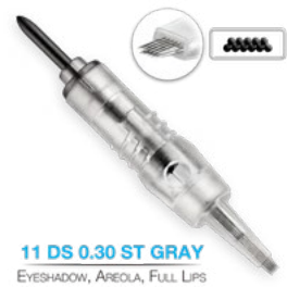
11 DS 0.30 ST GRAY EYESHADOW, AREOLA, FULL LIPS