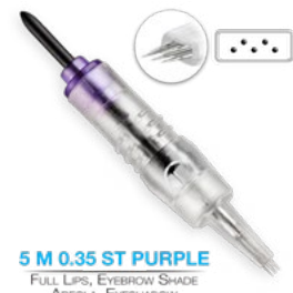
5 M 0.35 ST PURPLE FULL LIPS, EYEBROW SHADE AREOLA, EYESHADOW