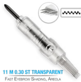
11 M 0.30 ST TRANSPARENT FAST EYEBROW SHADING, AREOLA