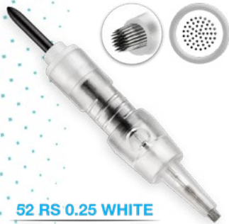
52 RS 0.25 WHITE PMU & TATTOO REMOVAL

For centuries tattoos were popular for various reasons such as: social status, traditions, fashion and more. In recent years permanent makeup treatments became popular typically on the found on the face. Unfortunately, there are many bad results, discoloration of the result, unfit design, or simply the client dislike it and wish that it will be removed.