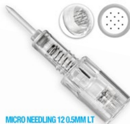
MICRO NEEDLING 12.05MM LT