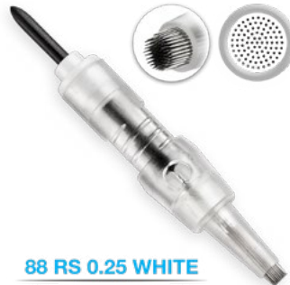
88 RS 0.25 WHITE PMU & TATTOO REMOVAL