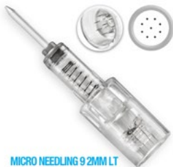
MICRO NEEDLING 9.2MM LT

Revitalize Your Skin's Natural Ability to Heal Itself