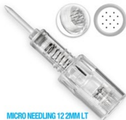
MICRO NEEDLING 12.2MM LT