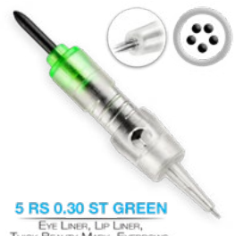
5 RS 0.30 ST GREEN EYE LINER, LIP LINER, THICK BEAUTY MARK, EYEBROWS