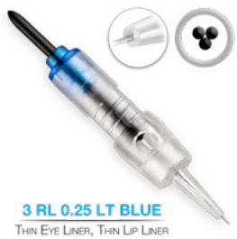
3 RL 0.25 LT BLUE THIN EYE LINER, THIN LIP LINER