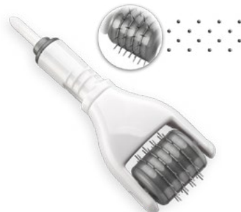
SCALP ROLLER HAIR FOLLICLE SIMULATION

With the roller system, large areas are filled within several minutes, resulting in a completely realistic texture with remarkably accurate appearance as a hair follicle.